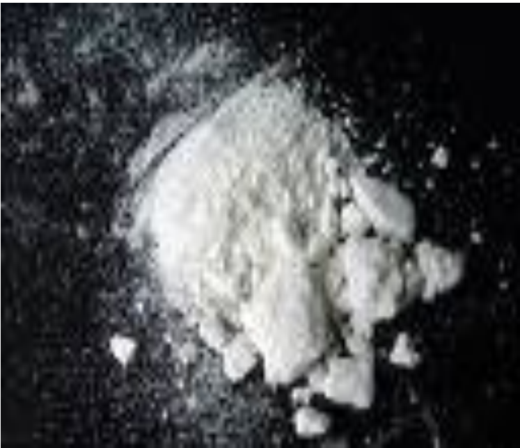
This substance above is only a small dosage of crack cocaine compared to the approximate millions of dollars worth that was generated around Pittsburgh.